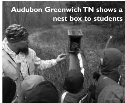
Audubon Greenwich TN shows a nest box to students

Join spring training sessions, shadow classes, and soon you will be on the trails sharing your knowledge and passion for nature with young people.