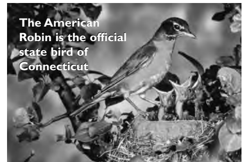
The American Robin is the official state bird of Connecticut