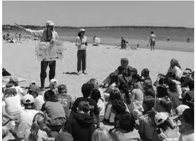
Students learning about Long Island Sound during a field trip to the beach at Greenwich Point.

In addition, Audubon Greenwich received $10,000 from the Horizon Foundation to support our nature education programs, and to increase