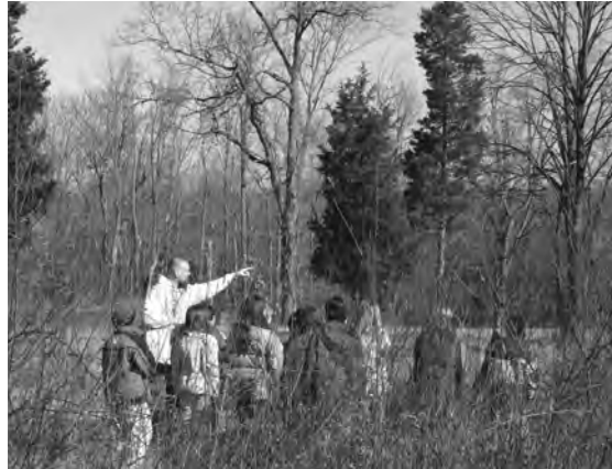
Audubon's Naturalists host scout programs throughout the year.