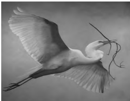
“In Flight” by Teri DiMargo, oil on canvas

Silvermine’s art exhibitions are hailed as showcases for New England talent, drawn from over 300 juried artist members. In this exhibit, the artists were selected by jury competitions at Silvermine, Carriage House in New Canaan, and Ferguson Library in Stamford.