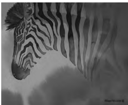
“Evening Thoughts, Zebra” acrylic ink

To learn more about artwork by Alison Nicholls, visit: www.NichollsWildlifeArt.com .