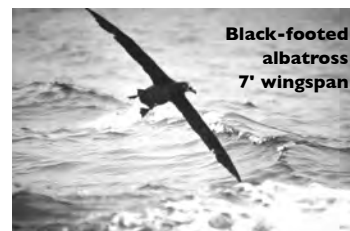
Black-footed albatross 7' wingspan