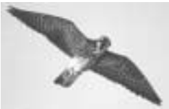
The powerful Peregrine Falcon always generates excitement for the hawk watchers.