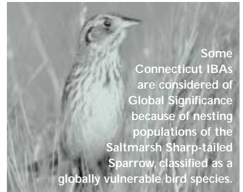
Some Connecticut IBAs are considered of Global Significance because of nesting populations of the Saltmarsh Sharp-tailed Sparrow, classified as a globally vulnerable bird species.