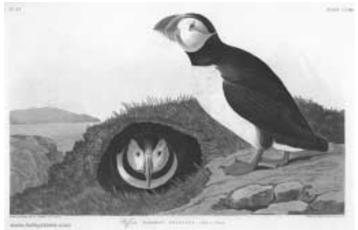
Atlantic Puffin by John James Audubon

Audubon continues to take up the torch for avian conservation, monitoring bird populations and sounding alarm bells through Audubon chapters, Audubon magazine and its diverse network of nature centers. This national network of community-based nature centers and chapters, engages millions of people of all ages and backgrounds, in positive conservation experiences, educational programs, and advocacy on the behalf of areas sustaining important bird populations.