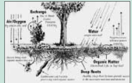
Soil Food Web Diagram

For more information try www.organiclandcare.net .