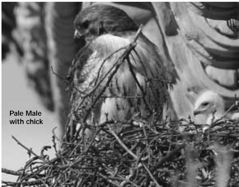
Pale Male with chick

For the status of Pale Male's nest, visit www.palemale.com .